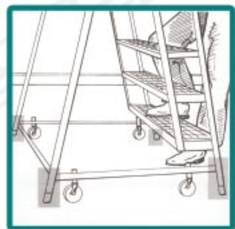
Make sure all four corners are securely seated before climbing on the ladder.