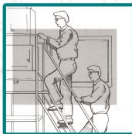
Do not overload ladder. Check manufacturer's capacity.

Always exercise ordinary care and common sense in the usage of ladders. See ANSI A14.7 for more information.