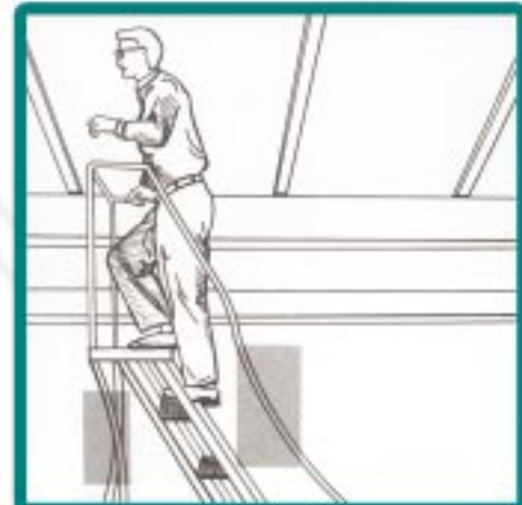
Never use a damaged ladder.