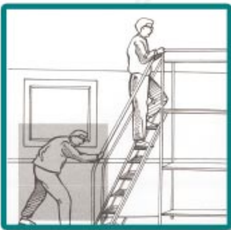
Do not move the ladder when someone else is on it.