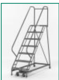
50° Safety Angle