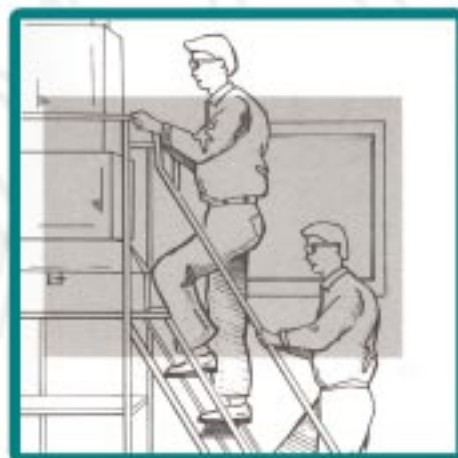
Do not overload ladder. Check manufacturer's capacity.

Always exercise ordinary care and common sense in the usage of ladders. See ANSI A14.7 for more information.