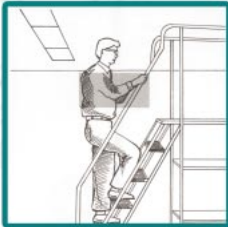
Always use the handrails.