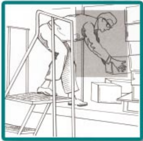
Do not lean off ladder.