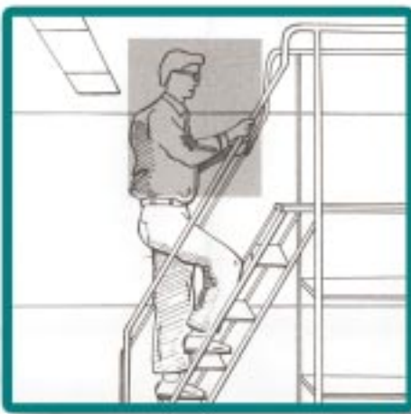
Face ladder when climbing up or down.