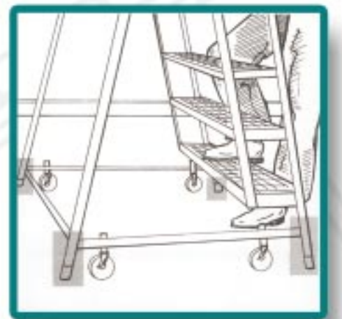
Make sure all four corners are securely seated before climbing on the ladder.