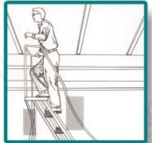
Never use a damaged ladder.