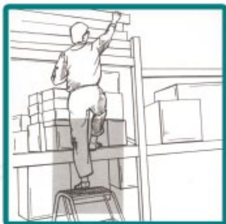
Do not climb off the ladder.